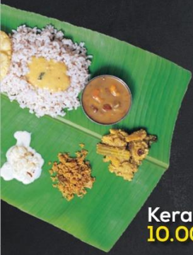
Kerala Meals 10.00 Dhs